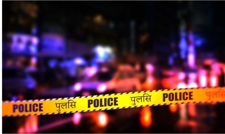
Delhi, Maharashtra, Rajasthan, Uttar Pradesh and Haryana. Investigators said he had previously been booked