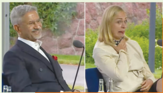
VIRAL MOMENT FROM FINLAND

New Delhi.(Agency) A light-hearted exchange between External Affairs Minister S Jaishankar and Finland's Foreign Minister Elina Valtonen has gone viral on social media, with Jaishankar's quick-witted response and the Finnish minister's reaction emerging as one of the most talked-about moments of his visit to the Nordic nation. The moment came during a media interaction following bilateral talks between the two leaders. As Jaishankar referred to discussions on defence cooperation, Valtonen jokingly remarked that the two sides had signed many deals. "You're not supposed to say that," Jaishankar shot back with a smile, prompting an amused reaction from Valtonen, whose expression quickly became the centre of attention online.