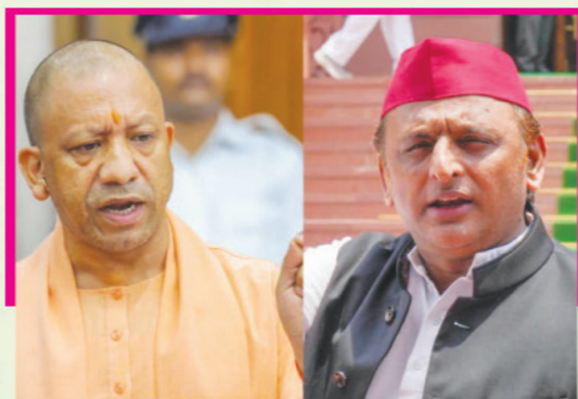
Referring to the mythological incidents, the chief minister pointed out that Lord Ram had acted against forces that sought to destroy centres of learning and research. "Demons like Tadaka made attempts to destroy centres of knowledge. Lord Ram made every effort to

New Delhi.(Agency) Uttar Pradesh Chief Minister Yogi Adityanath's warning over the controversial issues of so-called "Love Jihad" and "Land Jihad" has evoked a sharp response from Samajwadi Party chief Akhilesh Yadav. While the chief minister warned the citizens to remain "vigilant" over what he called the "attempts to change the demography", Yadav took a swipe at Yogi Adityanath saying he "doesn't understand love".