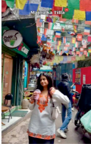
parked outside the area on a daily basis. The narrow lanes of the settlement have also become a matter of concern. Visitors often complain that the area consists of extremely