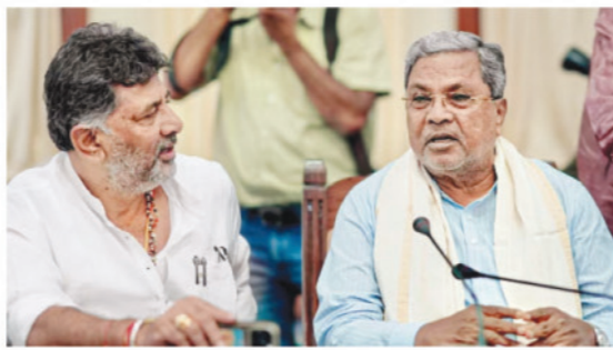
This unusual housing arrangement is not entirely unprecedented in Karnataka's political history. A nearly identical situation occurred back in 2021, when BS Yediyurappa, the tallest Lingayat leader of the Bharatiya Janata Party (BJP),

relocate his official base to another suitable, government-allotted property instead of moving into the traditional CM house.