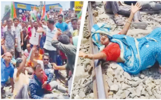
kicking us in the stomach," one protester said, arguing that the eviction drive would leave many families without any source of income. The protest comes amid a large-scale railway land

High drama unfolded at Gobardanga Railway Station in Bengal's North 24 Parganas district on Tuesday as traders and hawkers blocked railway tracks, protesting against eviction measures amid an anti-encroachment drive across the state. Videos from the station showed men and women occupying the tracks and raising slogans of "choilbe na, cholbe na" (we will not tolerate this) as they resisted efforts to remove stalls and shops. In a desperate show of defiance, an elderly woman lay down on the railway tracks during the protest. The demonstrators said their livelihoods depended entirely on the businesses they operated at the station and accused railway authorities of taking away their means of survival. "They are