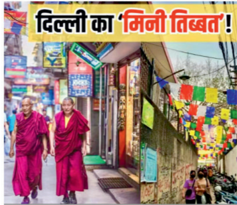
present size without the active support, protection or negligence of officials from multiple departments over many years. According to people familiar with the area, the colony was very different several decades ago. They recall a time when only temporary shelters and small structures existed there. Today, however, the locality reportedly

Serious questions are being raised over a large settlement allegedly spread across government land inside the Yamuna floodplain near Majnu Ka Tila and close to the historic Gurdwara Majnu Ka Tila Sahib. According to long-time local observers, thousands of multi-storey buildings, including seven-storey and eight-storey structures, have come up on government-owned land over several decades without any major action from the authorities. The area, commonly referred to as the Tibetan Colony or Majnu Ka Tila settlement, has witnessed massive commercial expansion. Critics allege that the colony contains a large market, hotels, guest houses and other commercial establishments operating from buildings constructed on land that originally belonged to the government and formed part of the Yamuna riverbed area. Local residents and activists allege that officials from various government departments, including civic and land-owning agencies, were fully aware of the growth of the settlement. They further claim that the colony could not have expanded to its