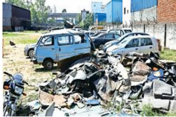
The image shows a large pile of scrap metal and parts, likely from vehicles, at a scrapping facility.

ility, with confirmation from the owner that the engine had been replaced suspiciously. While officials were willing to offer a solution after the complaint was strongly pursued, the episode raises concerns about the custody and integrity of vehicles once they enter the system. Efforts to seek clarity from the Delhi Transport Department and the Delhi Transport Minister failed to yield a response on the matter. With only one operational facility in Delhi handling both enforcement-led inflow and limited voluntary scrapping, the current situation reflects a gap between policy rollout and on-ground capacity. Backlog of vehicles, low participation from owners and concerns around oversight together point to a system under pressure, even as the city pushes forward with its broader transition towards cleaner mobility.