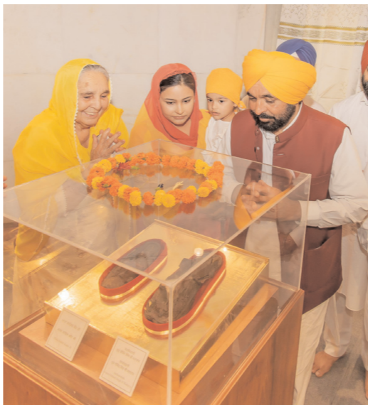
that not only Sikhs, but every human being derives strength and inspiration from the sacred land blessed by the great Gurus. Contd.....page-3

their entire life in jail, sending a firm message that no act hurting religious sentiments would be tolerated anymore. Sharing a few snippets on X, CM Bhagwant Singh Mann stated: "Today, I had the privilege of paying obeisance at Takht Sri Harimandir Ji Patna Sahib, the sacred birthplace and land blessed by the holy footsteps of the Tenth Master, Guru Gobind Singh Ji. I bowed before the Guru and offered prayers for the prosperity, well-being, and ever-rising spirit of Punjab, Punjabis, and the entire Sikh Sangat. I also expressed my heartfelt gratitude to the Guru Sahib for blessing us with the opportunity to uphold the sanctity of the holy Shabad Guru by enacting a strict law against beadbi. May Guru Sahib continue to shower His immense blessings upon everyone." After paying obeisance, CM Bhagwant Singh Mann said, "I was blessed with the opportunity to pay obeisance at Takht Sri Harimandir Ji (Patna Sahib), the sacred birthplace of Sahib Sri Guru Gobind Singh Ji. Bowing before Guru Sahib's divine presence, I prayed for the prosperity, well-being and eternal Chardi Kala of Punjab, Punjabis and the entire Sikh Sangat across the world." The Chief Minister said