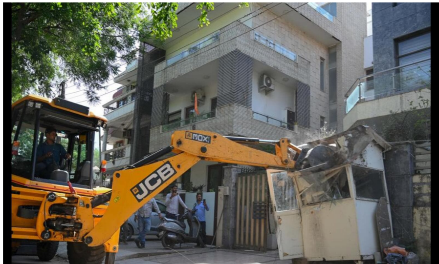
priority list. These sectors are home to former top

the kitchen gardens and private parks (unauthorised green extensions on public land); raised ramps high concrete slopes that obstruct drainage and road width; obstructions flower pots; permanent fencing and guard portacabins; commercial encroachments, kiosks, carts and unauthorised sheds. Resident Welfare Associations (RWAs) have largely welcomed the move but remain sceptical. "In the past, the bulldozer often stops right before a 'VVIP' gate," said a representative from a Sector 15 RWA. "We want a uniform clean-up. If a common man's ramp is broken, the retired officer's garden must go too."