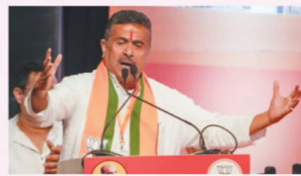
CATTLE SMUGGLING IMPOSSIBLE IN BENGAL NOW, AMIT SHAH SAID

Trinamool Congress in Birbhum) came under the radar of central investigative agencies for their association with smuggling networks. He was first arrested and then granted bail in the Supreme Court.