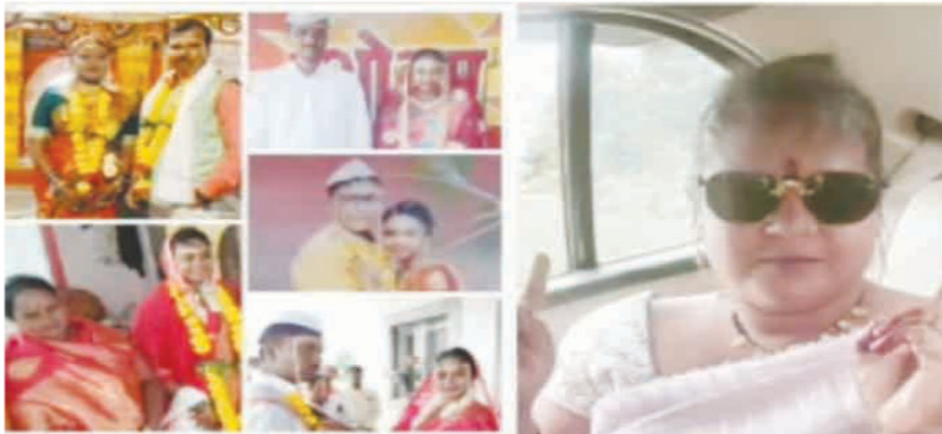
dark before the wedding. A complaint has now been registered at Chaklamba police station, and an investigation is underway.