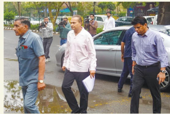
Ambani Group (RAAG) companies.

According to sources, the attached properties belong to Reliance Communications (RCOM) and Reliance Infrastructure Ltd. (R-Infra) of the Reliance Anil