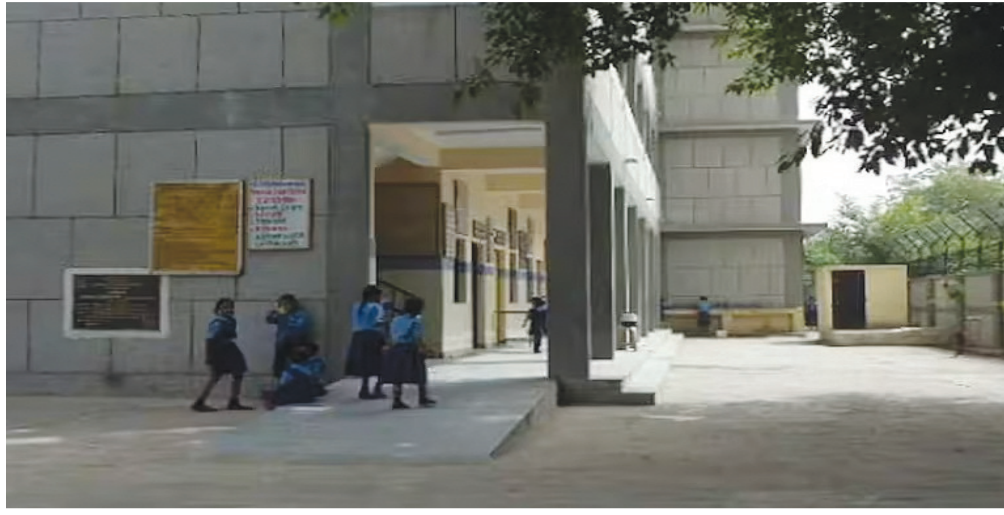
Keshavpuram, Shahdara (North and South), Rohini, Civil Lines, Karol Bagh, Narela, and Central. The order directs all officers to report to their respective Zonal Deputy Directors of Education with immediate effect. "Efforts were made to fill vacancies by issuing orders for 63 positions, but many declined,

The Municipal Corporation of Delhi has posted 18 School Inspectors (LACs) across several zones, signalling a recalibration of monitoring within its education department. School inspectors, appointed zone-wise, are tasked with monitoring schools in terms of performance, activities, quality of education, and infrastructure. Each inspector typically oversees 30-35 schools in a zone and plays a critical role in ensuring attendance and compliance with academic and administrative standards. Of the 81 sanctioned the inspectors posts, 18 have now been filled through this order, with more postings expected in the coming days to strengthen ground-level monitoring and checks. According to an office order issued by the MCD's Central Establishment Department on April 20, officials have been posted in zones including West,