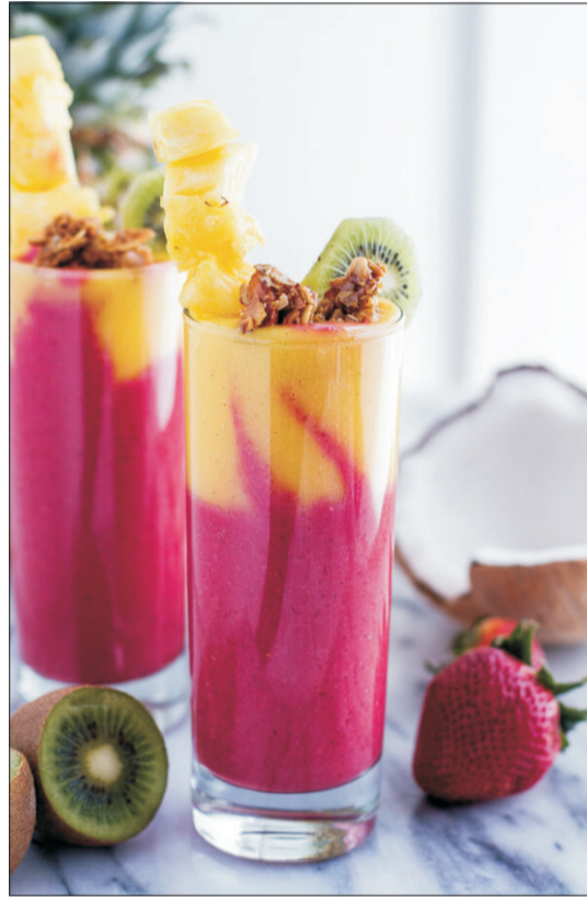
pleasant acidic kick in my mouth.

I followed a similar routine and pulled in exactly the same ingredients with two exceptions. I added two strawberries and a spoon of peanut butter. This changed the taste of my smoothie to make it a little more on the side of sour. I supposed that my kiwi was also a little more tart than the previous day. It left me with a