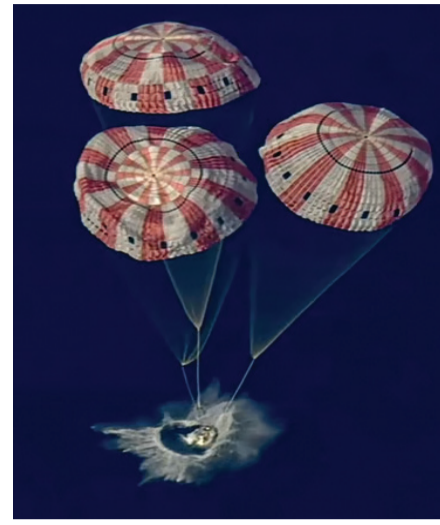
or 24,661 mph (39,668 kph) — just shy of the record before slowing to a 19 mph (30 kph) splashdown. "A perfect bull's-eye splashdown," reported Mission Control's Rob Navias. Artemis II's record flyby and views of the moon

The last time NASA and the Defense Department teamed up for a lunar crew's reentry was Apollo 17 in 1972. Artemis II was projected to come screaming back at 36,170 feet (11,025 meters) per second —