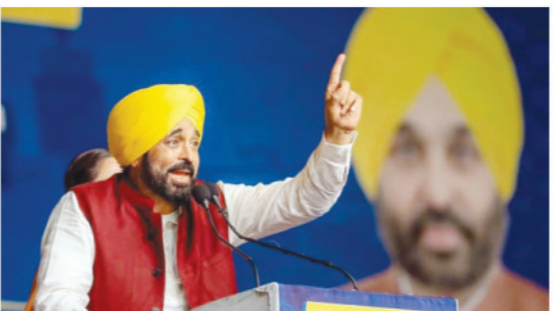
Mann said. Comparing arrangements at his own event with those at the SAD rally, Mann added, "Look at our rally...there are generators for power needed for

Chandigarh.(Agency) Punjab chief minister Bhagwant Mann on Monday alleged that electricity theft was carried out at a Shiromani Akali Dal (SAD) rally held at Muktsar and said legal action will follow soon. However, the PSPCL authorities at Muktsar said that they were still doing inquiry. Addressing a public gathering at the Patiala Grain Market, Mann took potshots at SAD and its president, Sukhbir Singh Badal. "Their Punjab Bachao rally took place in Muktsar on Monday. It was found that they were taking the electricity supply for the rally directly from the transformer by theft. We will lodge an FIR for this violation, and action will be taken as per law,"