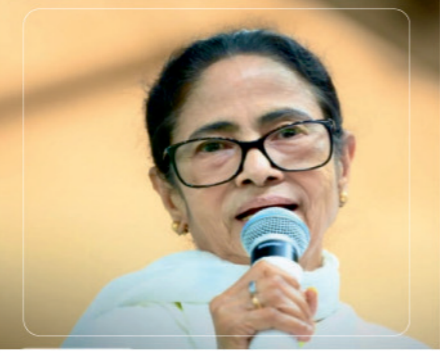
Banerjee declared, assuring affected citizens of political and legal support. The Chief Minister claimed that the deletions were not random but carried out in a selective and systematic manner. According to her, districts with

Kolkata, 7th April : In a strong political statement that has triggered fresh controversy, West Bengal Chief Minister Mamata Banerjee on Tuesday alleged that names of people belonging to the Matua community, Rajbanshis, and minority groups have been deliberately removed from voter lists following the Special Intensive Revision (SIR) exercise in the state. Addressing a large public rally in Nadia district, Banerjee accused the Centre of adopting a discriminatory approach and targeting specific communities in the process of revising electoral rolls. She asserted that such actions strike at the very foundation of democracy and raised serious concerns over the fairness of the electoral system.