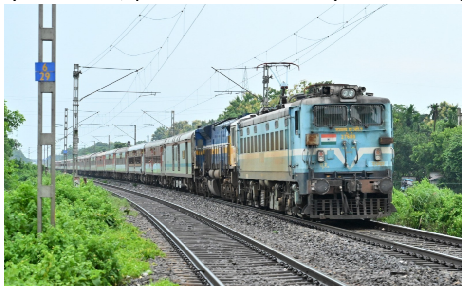
direction, train no. 06572 (Katihar - Yesvantpur Jn.) weekly special has been extended to run on every Friday from 10th of April 2026 to 17th of July 2026. This train will operate with the existing schedule of service, timings, composition and stoppages. Special train no. 08047

extended to run on every Friday from 10th of April 2026 to 17th of July 2026. This train will operate with the existing