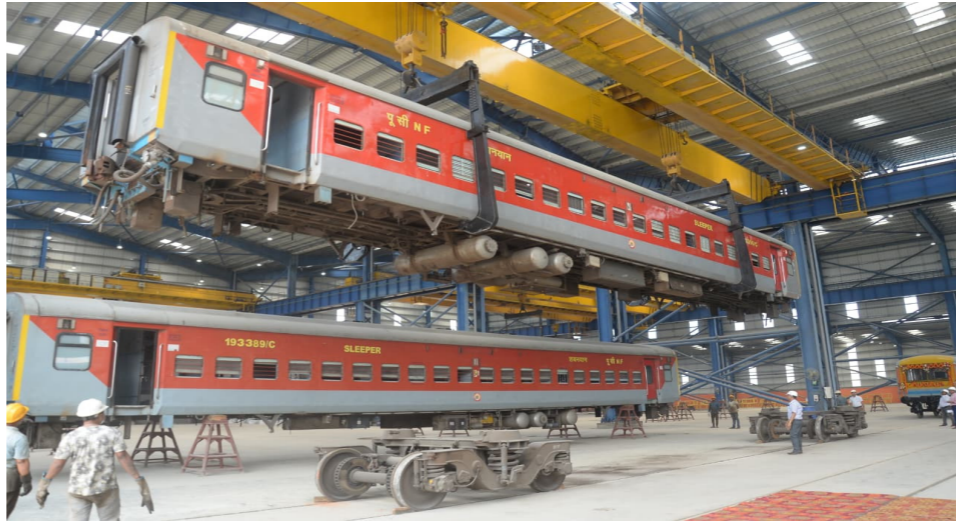
has begun in the zone. Infrastructure augmentation included commissioning of two new Self-Propelled Accident Relief Medical Equipment (SPARME) at New Bongaigaon commissioned in the Rangiya division to enhance the accuracy of weight in Electronic In-Motion Weigh Bridge (EIMWB), further strengthening opera-

Sleeper Train has been initiated at Kamakhya Coaching Depot. Additionally, maintenance of eight Amrit Bharat trains and New Guwahati. To cater to growing demand, 22 coaches were augmented across 21 trains. A Test Rake has also been