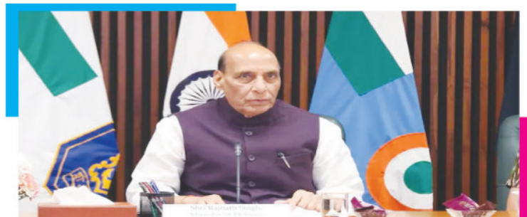
Taragiri today. Visakhapatnam also serves as both the construction hub and current home port for India's nuclear submarine fleet.

Aridhaman is the third of India's highly classified project to build and operate nuclear-powered ballistic missile submarines (SSBNs). Its formal commission will follow in the footsteps of its predecessors, INS Arihant (commissioned in 2016) and INS Arighaat (commissioned in August 2024). Rajnath Singh's post today coincides with his visit to Visakhapatnam, headquarters of the Indian Navy's Eastern Command, where he is scheduled to commission the indigenously built advanced stealth frigate