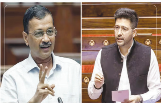
Criticising Chadha's conduct in Parliament, he said the party gets limited time to speak and must use it to raise critical national issues.

"In that time, we can either fight to save the country or talk about making samosas cheaper at airport canteens," he remarked.