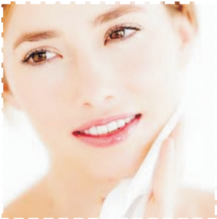
and Amy Adams.

Neither too short nor too lengthy, the Lob (Long Bob) is your definite cut of choice this summer. Fresh, youthful and flattering, women of all ages and any face shape can sport it with elan. Since its both quirky and cool, it's a great option for women tired of their long hairdo. From sexed-up waves to 70s groupie bangs, Hollywood stars are wearing the Lob in smoking-hot ways. Take inspiration from Cameron Diaz, Karlie Kloss, Alexa Chung