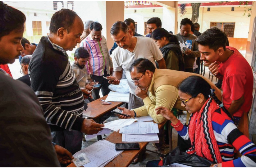
with electoral registration officers and their assistants. Any dilution of this scheme risks creating parallel

THE Supreme Court's intervention in the West Bengal Special Intensive Revision (SIR) of electoral rolls seeks to steady a process that is facing political and administrative turbulence. By extending the deadline by a week and clearly limiting the role of micro-observers, the Court has attempted to balance two imperatives: safeguarding the integrity of electoral rolls and ensuring procedural fairness. At the heart of the dispute lies trust — or the lack of it. The Election Commission of India (ECI) has flagged alleged intimidation, violence and public statements by ruling party leaders that, it says, discouraged officials engaged in the SIR exercise. The state government, on the other hand, has questioned the manner in which the revision was conducted, particularly the use of micro-observers and digital tools that, it argues, led to arbitrary exclusions and confusion among voters. The Court's clarification that micro-observers cannot pass orders is significant. Electoral law vests decision-making powers