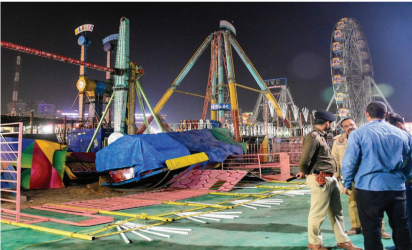
Bhuj earthquake, the National Disaster Management Authority released a document on the role of all

THE Haryana government’s decision to formulate a comprehensive policy to regulate fair and adventure rides underscores the urgent need for a national safety framework to address lapses and risks. The collapse of a giant swing at the Surajkund International Crafts Mela revived memories of similar incidents — all preventable — at amusement parks, fairs and ropeway facilities in various parts of the country. The Surajkund tragedy puts the spotlight on what is common practice. Ride safety protocols are restricted to paperwork, and most of the time are nothing more than self-attested affidavits assuring adherence. The essential pre-event inspection exercise is rarely carried out. Standard operating procedures lose meaning in the absence of serious repercussions for non-compliance. Responsibility and accountability have to be the non-negotiable benchmarks for the vendors as well as the officials.On January 26, coinciding with the 25th anniversary of the devastating