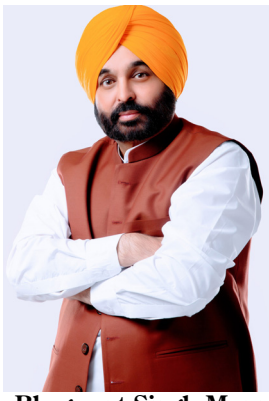
Bhagwant Singh Mann Chief Minister, Punjab

India today takes pride in being the largest democratic Republic in the world, which is the result of both our long and unparalleled movement for independence and of the unique constitution which the country adopted on January 26, 1950. The day assumes far more significance as our constitution came into force on January 26, 1950 following relentless efforts of great national leaders and statesmen. The constitution embodies the quest for happy and prosperous life in an egalitarian society and it enshrines the cardinal principles of justice, liberty, equality and fraternity. The architects of our sacred Constitution have given us a Parliamentary Democracy which aims at social progress and equal opportunities of livelihood besides quality life for all. The Constituent Assembly kept in view the fact that India is a country rich in cultural, religious, linguistic and regional diversity. Such a diverse country needed a constitution which truly reflected deep and profound respect for this diversity. Universal Adult Franchise had to be the bed rock on which the constitution was based. It was really a moment of glory for all of us as we got the power to exercise our franchise, fulfilling the cherished aspirations of our forefathers of having the 'Government of the