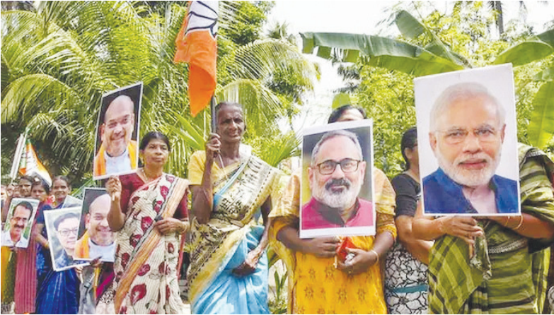
Munambam, located in Kerala's Ernakulam district, has been at the centre of protests and court cases after over 404 acres of land were declared as waqf property by the Kerala Waqf Board in