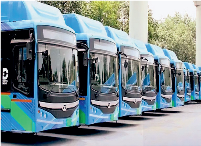
To boost ridership and improve integration with the Delhi Metro, the route will be revised to include additional metro stations such as Dwarka Metro Station and Dwarka Sector-8 Metro Station. This improved

reach exactly where they are needed the most. Our focus is to eliminate gaps in accessibility, reduce waiting time, and make public transport the most convenient choice for every commuter.” “In this direction, restarting the Dwarka Circular Service with DTC electric buses marks an important milestone. Dwarka is one of Delhi’s fastest-growing residential and commercial pockets, and the demand for reliable last-mile connectivity has been consistently rising. With the reintroduced circular service, commuters will now have smoother access to key points across Dwarka, especially major metro stations such as Dwarka Metro Station and Dwarka Sector-8 Metro Station,” the Minister added.