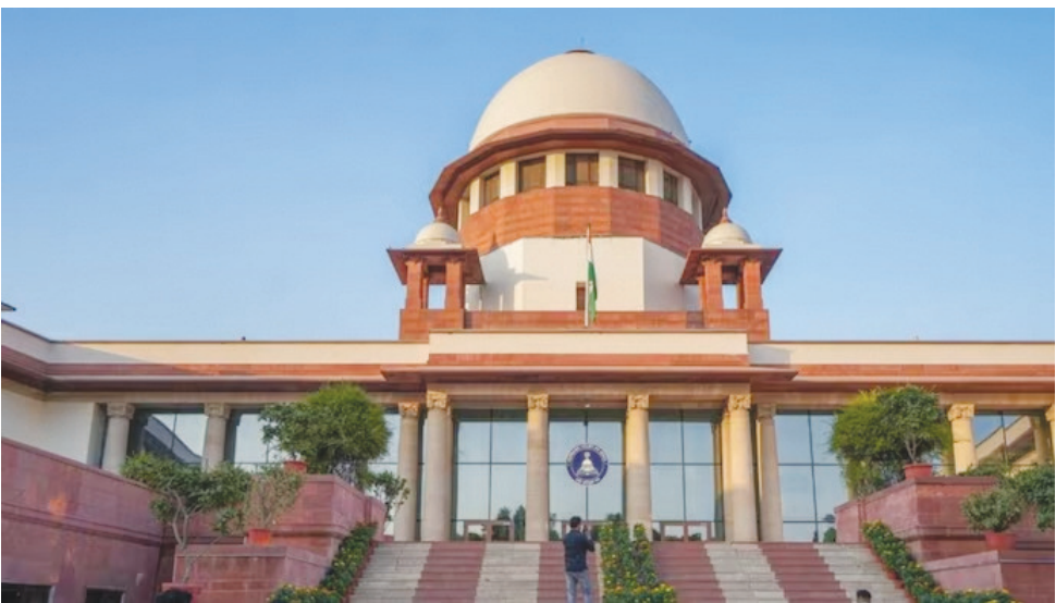
amendments to the Rights of Persons with Disabilities Act, 2016 to expressly cover

help women who have been force-fed acid instead of throwing acid on their faces. "There was an acid attack on me in the year 2009. But now I work for others. There are others who are made to drink acid and they suffer equally. They are made to eat food by food pipe," Malik submitted. She further told the bench that medical aid and compensation is given to women who have faced an acid attack that disfigures their body from outside because the damage is visible. "But women who have been force-fed acid often don't get the timely medical aid or even compensation because the damage is internal and more difficult to prove."The CJI expressed his shock at women being forced to drink acid. "This issue is shocking. Unbelievable that something like this is still happening," the CJI said and asked Solicitor General (SG) Tushar Mehta to consider proposing