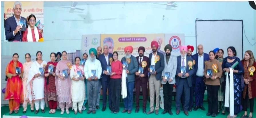
Achievement Award by Akal College Council Mastuana Sahib in collaboration with Da Jist Sangrur