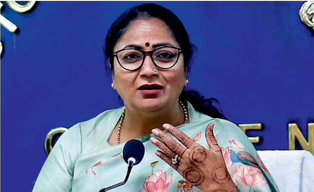
said. Targeting legislators, she said MLAs often cite funds on paper but fail to prioritise

New Delhi.(Agency) Chief Minister Rekha Gupta on Tuesday criticised previous governments for failing to provide essential civic infrastructure, saying that large parts of the national capital still lack proper water and sewer lines even after decades of governance. Gupta said she has personally seen “no improvement” in several areas over the last 15 years. “When I cross these areas, I have not seen anything change. After 15 years of Congress and 11 years of the AAP government, the situation remains the same. In half of Delhi, there is still no water line, no sewer line. Water tankers are still supplying water. It is surprising that this is the condition of the national capital,” she said. Gupta said that after 27 years, desilting and repair work have finally begun on key pipelines and sites to address chronic water shortages. “The system is still based on the 1973 master plan. In the last 50 years, no new system has been created. Nobody seemed worried,” she