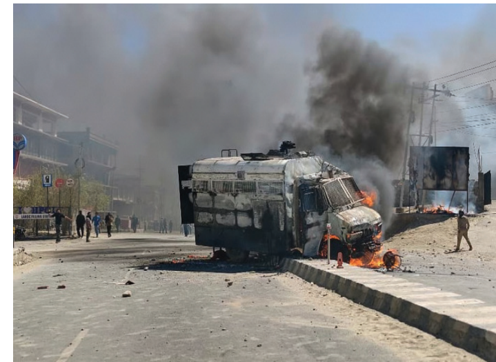
The Sixth Schedule provides constitutional safeguards and greater autonomy to tribal areas.If in the undivided J&K Ladakh was the region most ignored by the

A seemingly Gandhian agitation for Ladakh's statehood went sideways in the peaceful town of Leh as a sudden burst of protester fury snowballed into vandalism and a regrettable loss of lives.The agitation was spearheaded by Sonam Wangchuk, who had begun a hunger strike on September 10. What's said to have lit the fuse were concerns over the deteriorating health of some strikers, an administrative response perceived unsatisfactory, and some fiery speeches at the protest venue. However, the actual cause of the violence is a matter of detailed investigation.Ladakh has been placed under curfew and Wangchuk has called off his protest. This is not the outcome he would have wanted. The engineer has inspired generations of scientists through phenomenal contributions to climate innovation and education reforms, which was showcased in the 2009 blockbuster, 3 Idiots. Yet, now it has also emerged that the CBI is probing his Himalayan Institute of Alternatives for alleged violation of the Foreign Contribution (Regulation) Act. The demand for statehood, a separate legislature and Sixth Schedule rights germinated months after Ladakh was carved out of J&K as a separate Union Territory in 2019.