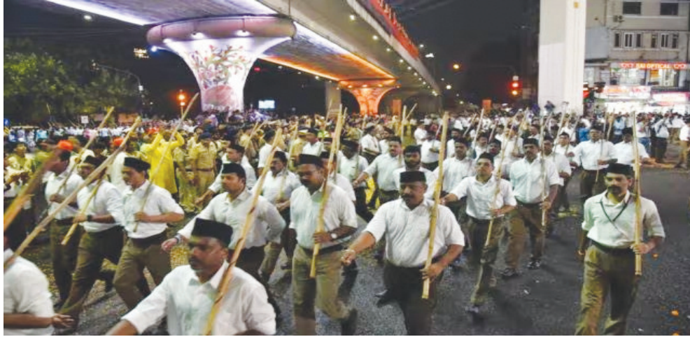
Smruti Bhawan, Reshimbag, Nagpur.

Earlier on Saturday morning, Bhagwat launched an audio-video album of the Sangh Prarthana at Maharshi Vyas Sabhagriha, Dr Hedgewar