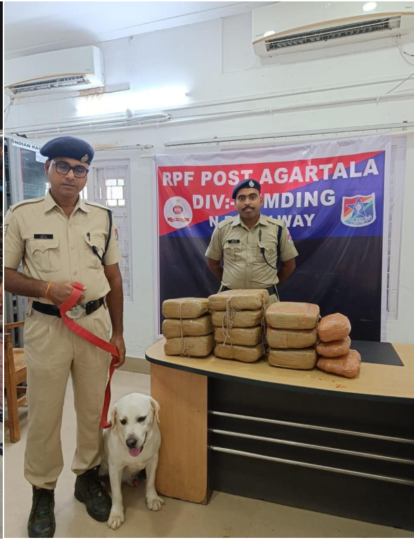
mately around Rs. 1.64 lakhs from B4 com-

RPF team of Dimapur recovered around 16.4 kg of unclaimed Ganja that worth approxi-