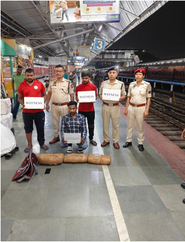
September, 2025, in another major operation,

Maligaon, 10th September: The Railway Protection Force (RPF) of N.F. Railway has intensified its drives against smuggling of contraband items. In the past few days, RPF teams carried out several successful operations across different locations under NFR, resulting in the recovery of approximately 59 kgs of ganja worth above Rs. 6.20 lacs. The RPF teams also apprehended several individual-sassociated withthe smuggling of these contraband items. The RPF team of Kamakhya post, on 9th September, 2025, during regular check and drive at the station, apprehended a person and seized contraband goods (Ganja). The seized item valued approximately around Rs. 60,000.00, weighing nearly around 6kgs. Later, the seized goods along-with the apprehended person was handed over to GRP/Guwahati for further necessary action. On 8th September, 2025, a joint team of RPF alongwith Dog Squad and GRP of Agartala Post, recovered 27 kgs of unclaimed ganja from a coach panel stationed at Agartala yard. The seized consignment valued approximately around Rs. 2.70 lakhs. The seized item