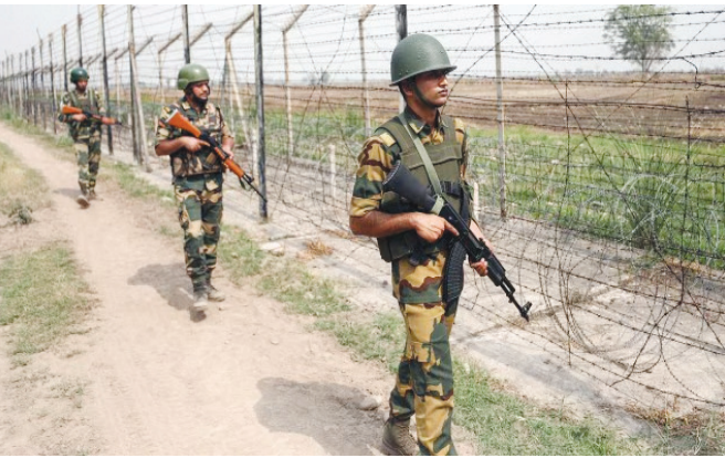
Gujarat’s Kutch district, the BSF said on Sunday. The BSF carried out a search operation on Saturday

The Border Security Force has apprehended 15 Pakistani fishermen and also seized an engine-fitted country boat near the Indo-Pak border in