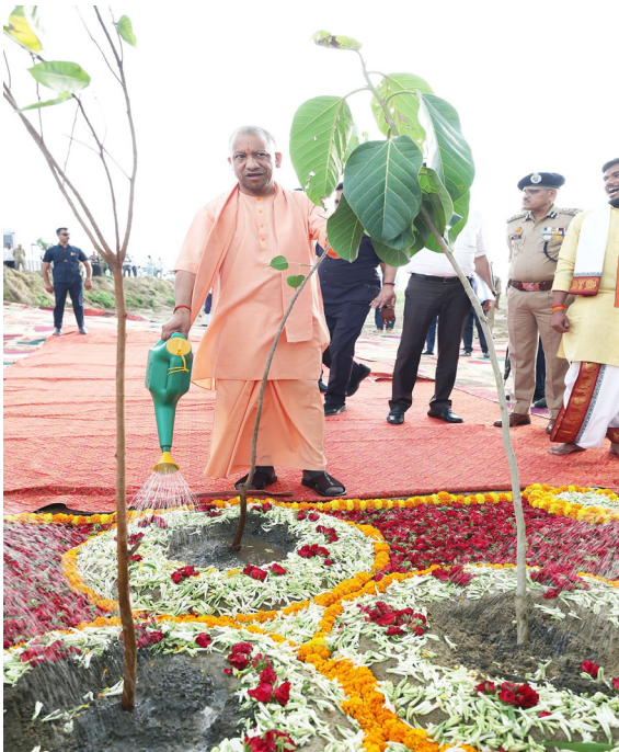
Putroham Prithivyaa", meaning, "The Earth is my mother, and I am her son." He

paign as an expression of gratitude towards both Mother Earth and all mothers, CM Yogi cited the Vedic verse "Mata Bhoomi: