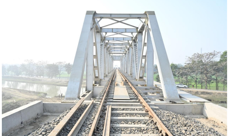
Kumar Chaudhary had earlier conducted a window trailing inspection, reviewing the overall progress of the infrastructure

Northeast Frontier Railway works. Notably, the sections from (NFR)/Construction, Shri Arun Araria-Araria Court-Rahamatpur