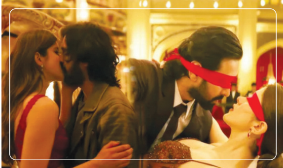
Shanaya Kapoor and Vikrant Massey talk about trust, comfort, and connection while filming intimate scenes in their upcoming film Aankhon Ki Gustaakhiyan.