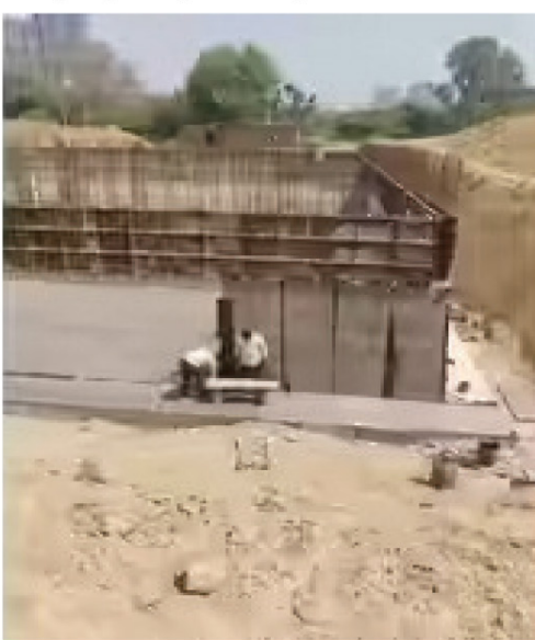
(WTP), which will be routed first to the Sector 72 boosting station and then boosted to Gwalpahari for final

diameters, ranging from 300mm to 600mm. "This boosting station is essential for resolving long-standing water supply issues in Gwalpahari and its neighbouring areas. We have prepared the estimates for laying the pipeline and machinery and the station's construction is underway," said a senior GMDA official. The work on civil infrastructure, which includes the construction of the boosting station, an underground water tank of 4,000 kilolitres, a sump, and a pump house, started in July last year and is being executed at a cost of Rs 4.3 crore. With 50% of it completed so far, officials expect to finish the remaining work by March 2026. An additional estimate of Rs 2.82 crore has been prepared for the procurement of equipment and machinery, including pumps, needed to run the station effectively. The station is designed to source treated water from Chandu Budhera water treatment plant