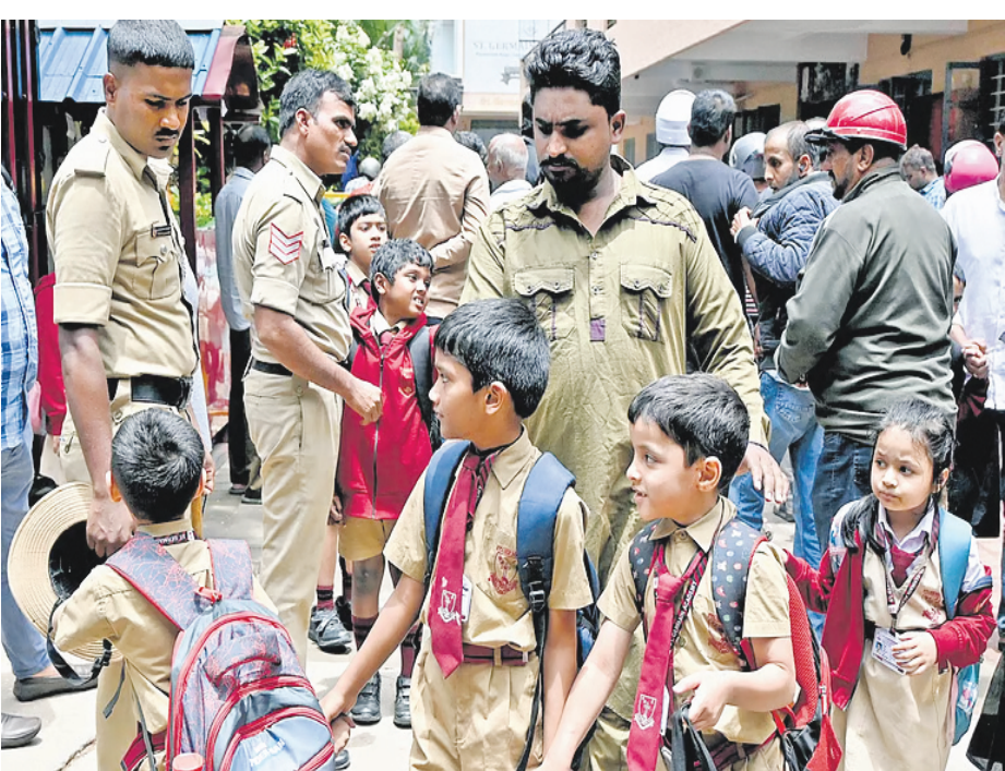
based dark web services and, more recently, to AtomicMail, which has seen a rise in abuse cases globally due to its short data retention window and lack of oversight.

BENGALURU .(Agency) After 40 schools in the city received bomb threat emails on Friday morning, police said the messages were sent using an offshore platform called AtomicMail.io, which deletes all user data, including sender details, after just seven days. Officials told TNIE that they are also looking into whether the emails were sent directly through such services or if they were triggered by “automated bots”, some of which are reportedly sold freely on Telegram. Since 2023, the services used in such threats have changed from Beeble to a Tor-based dark web mailer and now to AtomicMail, and they all don’t log IP addresses, keep no user records, and operate under jurisdictions that either reject legal cooperation or require treaties that India doesn’t have. According to officials, AtomicMail is part of a growing network of offshore platforms designed for “privacy-first” communication but misused for hoaxes, fraud, and cyber threats. This isn’t the first instance of Bengaluru schools receiving such threats. Between 2022 and 2024, Bengaluru reported 133 such cases. In 2023, most emails were sent through Beeble. Later, threat actors moved to Tor-