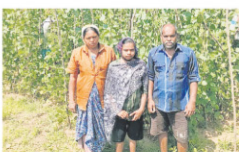
and carry on: Farmer

We bear losses due to fluctuation in prices