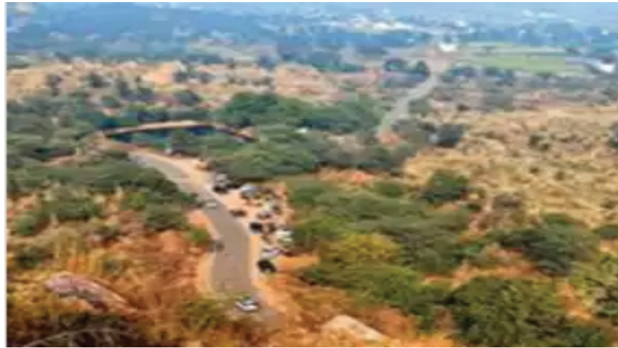
Section 4&5 of the Punjab Land Preservation Act (PLPA) 1900, which permits regulated non-forestry activities. "It was already in the proposed plan, but it

Gurgaon. With the legal hurdle cleared, the forest department has sought consent of the civic body for inclusion of 400 acres of land in Manesar area in Bar Gujar village to ensure reinforcement of the continuous patch for the development of Aravali Zoo Safari project. The project — announced in April 2022 by former chief minister Manohar Lal Khattar — aims to develop a 10,000-acre zoo safari that will involve keeping wild animals in vast enclosures, among other activities. The municipal corporation's consent is crucial for the preparation of the detailed project report (DPR) for the Aravali Zoo Safari. Though this patch was initially incorporated in the plan, the proposal to include Bar Gujar's land was halted due to a pending court case in Punjab & Haryana high court. However, with the case now resolved, the path is clear for the park's expansion. This area is adjacent to the Gairatpur Bas and Sakatpur area, which is already part of the project. The land in question falls under