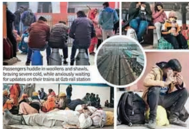
Passengers huddle in woollens and shawls, braving severe cold, while anxiously waiting for updates on their trains at Gzb-rail station

"I've been waiting here since 11am for the Gomti Express. The delay keeps increasing on the app, and railway officials provide no clear information as well," she said. The situation worsened with the cancellation of major trains — such as the Tejas Express and Kashi Vishwanath Express — forcing passengers to seek alternative travel arrangements. At the station, there was chaos and crowd everywhere. Many