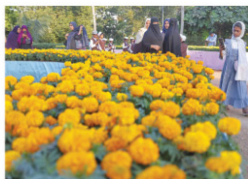
celebrations were called off in the wake of the devastating Mundakkai-Chooralmala landslides in Wayanad,"