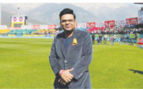
Barclay admitted that presently there is an overkill of cricket and at times he even lost track of the congested international calendar. "I reckon, gee, I'm at the apex of the game and I can't tell you who's playing around the world. In fact, I didn't realise that Sri Lanka were in South Africa until I read about Marco Jansen's seven wickets this morning,"

commercially helping to pool off-shore rights, using their teams to give opportunity to smaller full members and emerging countries, using their clout to open new territories and markets, collaborating closely with the ICC to help benefit members, as examples," he said.