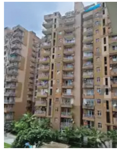
also given the option of choosing non-empanelled agencies with RWA