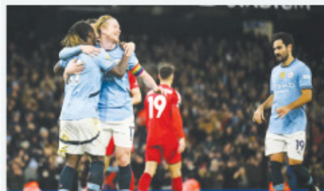
appearances. The 33-year-old showed what City have been missing as he rolled back the years and could well have had more than just one goal. Guardiola reacted to Sunday's 2-0 defeat at Liverpool by making four changes as Josko Gvardiol, Doku and Jack Grealish also came into the team. It took just eight minutes for City to make the breakthrough. İlkay Gundogan's cross was headed back towards goal by De Bruyne and Silva was in the right place to tap home from centimetres out. Guardiola claimed pre-match that Ederson remains his number one goalkeeper but the Brazilian was again benched in favour of Stefan Ortega. The German made a big save to deny Morgan Gibbs-White before Forest missed a glorious chance to put the Etihad crowd back on edge.

City move back into the top four and within nine points of Liverpool after their 3-3 draw at Newcastle. Pep Guardiola had to shoot down suggestions of a rift with De Bruyne on the eve of the game after bedding him back into action slowly with a series of substitute