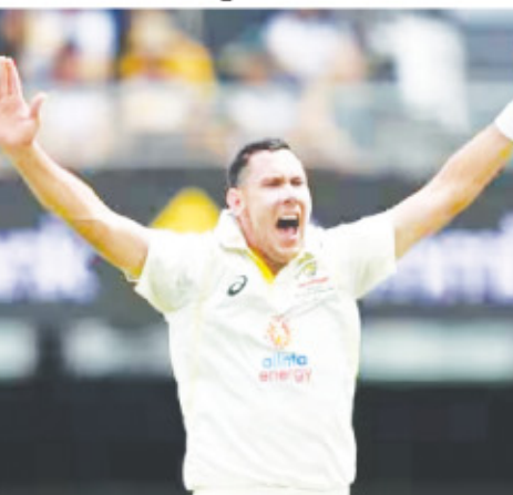
are yet to name their playing eleven for the upcoming pink-ball Test. The Adelaide test will kickstart from December 6 onwards, with India heading into the game with a mental and physical edge over the

Cummins also confirmed that Mitchell Marsh will be fit to bowl in the Adelaide Test, according to cricket.com.au. Boland's previous Test was against England in the prestigious Ashes 2023 series. The 35-year-old will be replacing Hazlewood who suffered an injury during the Perth Test of the Border-Gavaskar Trophy. On the other hand, Marsh has been added to the playing eleven even after battling with back stiffness, which stopped him from bowling at full tilt during India's second innings in the Perth Test, as per cricket.com.au. Speaking at the pre-match press conference, Cummins said that it's "pretty awesome" to have Scott Boland in the squad. "It's pretty awesome for someone like Scotty to come straight in," Cummins was quoted by cricket.com.au as saying. Meanwhile, India