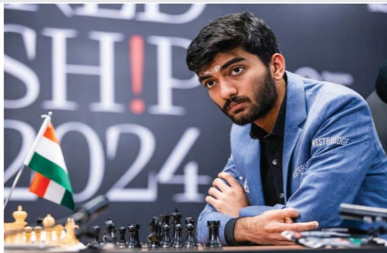
game of chess that won. Gukesh's victory signals a generational shift in the chess ecosystem.

IT'S been Gukesh Dommaraju's year. In September, he led the Indian team to a historic gold medal at the biennial Chess Olympiad. Now, the 18-year-old prodigy from Chennai has fulfilled a childhood dream by becoming the youngest world champion in chess history. He is the first Indian to hold the title after Vishwanathan Anand. Twists and turns marked the 14 games in Singapore. Gukesh and China's Ding Liren, the reigning champ, were tied with two wins each before the final game. Just when a draw seemed imminent, setting the stage for high-speed games to break the tie, Ding committed a dramatic blunder. He was gracious in defeat, marking the end of the three-week match that kept fans riveted across the globe. Former world champions Magnus Carlsen and Vladimir Kramnik may have criticised the quality of play, but in the larger scheme of things, it's the