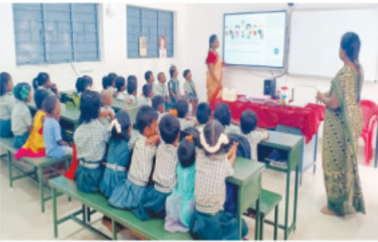
Setting a benchmark, the school has become the first government primary school in Pudukkottai to have its own auditorium. Other improvements include tiled classrooms, CCTV cameras, WiFi network,

PUDUKKOTTAI: A government village school once lacking in adequate facilities has undergone such a transformation with the concerted help of residents that it has been adjudged one of the best in the state and will be presented an award. The precincts of the Puliayachi Kudiyiruppu Panchayat Union Primary School at Vadakadu was once covered with shrubs. It now boasts of modern buildings and infrastructure designed to enhance educational experience after the villagers alongside the Parent-Teacher Association (PTA) and the school management committee (SMC) chipped in mostly for the revamp.