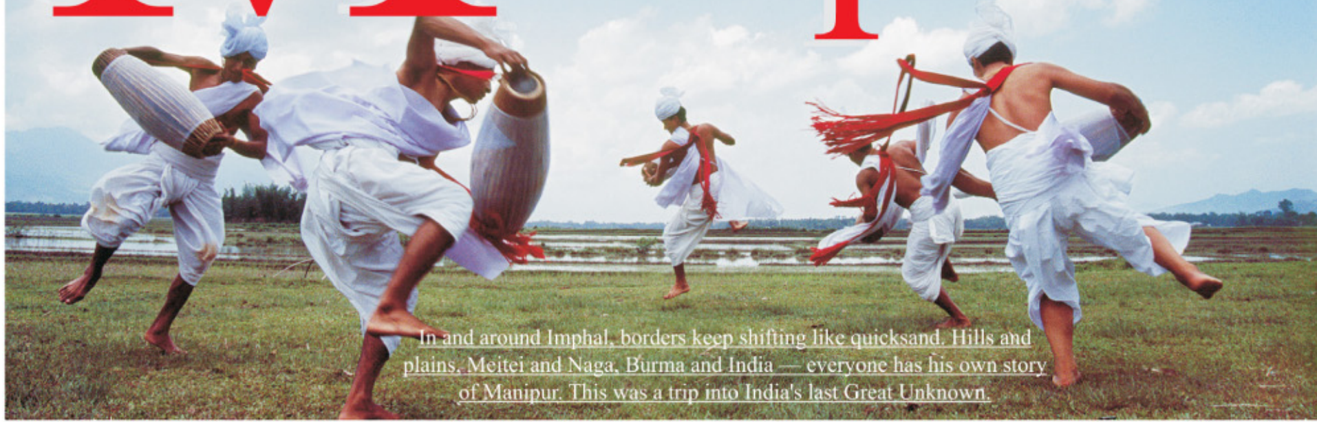
In and around Imphal, borders keep shifting like quicksand. Hills and plains, Meitei and Naga, Burma and India — everyone has his own story of Manipur. This was a trip into India's last Great Unknown.