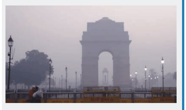
days. The absence of rainfall, combined with local and regional emissions and unfavourable weather conditions, contributed to heightened pollution levels. The lowest recorded AQI was 303, still within the 'very poor' range. November 18 saw the AQI reach 494, marking it as the second most polluted day on record. Ten days experienced AQI readings exceeding 390.

Saturday morning is expected to experience shallow to moderate fog. Variable winds below 4 kmph are forecast for the morning, increasing to 6-8 kmph from northwest during afternoon, before decreasing again in evening hours. The meteorological department predicts shallow fog for Saturday, with temperatures expected to range between 26 degrees Celsius and 10 degrees Celsius. Delhi experienced eight 'severe' air quality days this month, including two 'severe-plus'