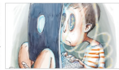
number of victims of digital addiction would be much higher.

THIRUVANANTHAPURAM: On November 17, a 15-year-old boy was found hanging at his house in Thiruvananthapuram city limits. On September 10, a 11-year-old boy was found dead in a similar fashion at his residence in rural parts of Thiruvananthapuram district. While unconnected, the two incidents have one thing in common: In both, the children allegedly ended their lives after they were reprimanded for continuously using mobile phones. Addiction to digital devices -- dubbed digital addiction -- has claimed the lives of 19 children in Kerala in the past three years, the state government records have revealed. The statistics prepared by the home department said another 22 children were found habituated to drug abuse and sexual offences after getting hooked to digital platforms during this period. Sources in the police said only a fraction of such cases come to the fore and the real