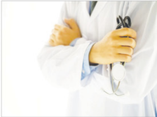
mission director (MD-NHM). The doctors alleged that at the recent review meeting with deans and directors, the MD-

CHENNAI: The Tamil Nadu Government Doctors Association (TNGDA) has announced a boycott protest on Monday to draw the chief minister's attention towards the alleged mistreatment of doctors by certain district collectors, directors, and other officials of the health department. In its press release, TNGDA said that, of late, doctors are treated like criminals by Tiruchy, Virudhunagar, Thanjavur, Tiruvallur, Mayiladuthurai, Dharmapuri, and Tirupattur collectors. The directors of the directorates of the health department are also ill-treating the doctors. The most recent incident was during the review meeting with deans by the National Health Mission (Tamil Nadu)