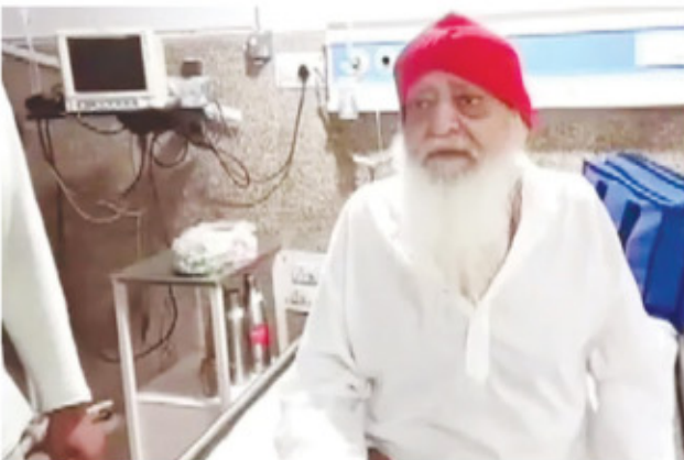
Jodhpur jail in Rajasthan in another rape case.

The Gujarat High Court on August 29 had rejected Asaram's plea for the suspension of life imprisonment in the case by a Gandhinagar court in 2023. Refusing to suspend the sentence and grant him bail, the high court had observed that no case for relief was made out. The sessions court in January 2023 convicted Asaram in the 2013 rape case, filed by a woman who was living in his ashram near Gandhinagar at the time of the crime. Asaram is currently lodged in