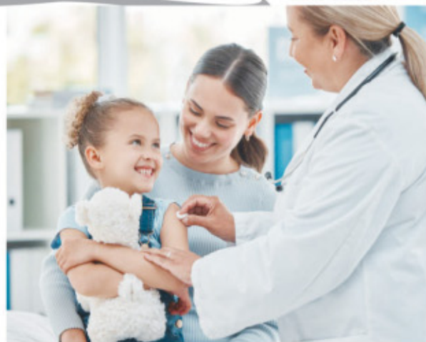
children and causes morbidity and mortality

2. Vitamin A: For healthy vision and skin Vitamin A acts similarly and plays a critical role in healthy vision, skin, and immune function. A deficiency can cause night blindness, dry skin, and even recurring infections. If your child usually complains of difficulty seeing in dim light or has dry, rough skin, it could be a sign of vitamin A deficiency. This vitamin is found in food staples such as carrots, sweet potatoes, and spinach. These nutrients will be sufficiently supplemented through continued consumption of these food items, but a severe deficiency may need supplementation. As per the study published in Frontiers, The clinical manifestations of vitamin A deficiency (VAD) involve night blindness, bitot's spots, corneal xerosis, and corneal scars. It is the most important cause of preventable childhood blindness among