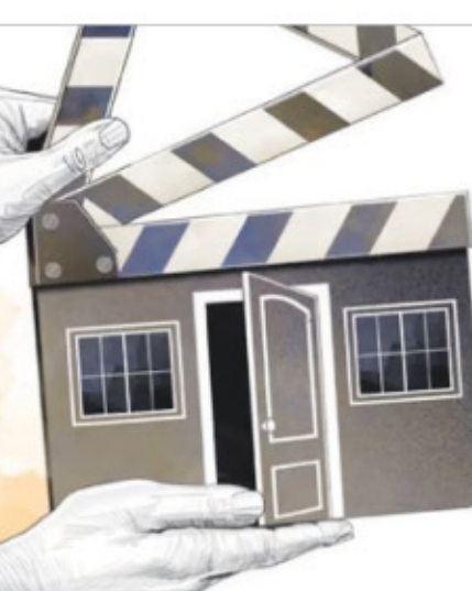
The Union Information and Broadcasting Ministry had informed the government that NFDC could continue operations if it provided facilities such as land and office space. The government then accommodated NFDC in KSFDC's Chitrangali studio complex to retain the agency in the state. However, NFDC

office to another state. But the move was averted following the intervention of Thiruvananthapuram MP Shashi Tharoor.