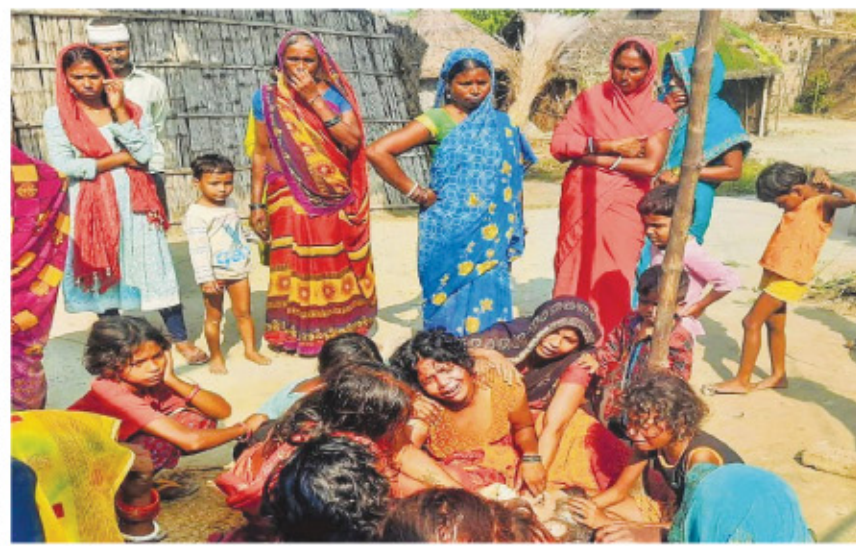
While law enforcement agencies have responded with

THE latest hooch tragedy in Bihar, claiming over 35 lives (unofficial reports put the figure at around 65) in Siwan, Saran and Gopalganj districts, exposes the stark inefficacy of the state's prohibition policy. Imposed in 2016, the liquor ban aimed to curb alcohol-related harm, but it has, instead, fuelled the rise of a thriving black market for illicit liquor, costing countless lives and leading to significant revenue loss. This tragedy is not an isolated incident. Bihar has repeatedly faced such fatal outcomes, with over 350 deaths linked to spurious liquor since prohibition began. The recurring nature of these incidents highlights the flawed implementation of the policy, where black-market operations exploit vulnerable communities, often targeting the poorest sections of society.