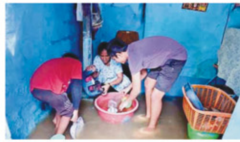
Malik Bazaar, Shanthinagar, being inundated due to a swollen stormwater drain.

61.99mm rain lashes city overnight from Sunday evening to early Monday morning. Bengaluru was flooded with a 61.99mm downpour, prompting Bengaluru Urban Deputy Commissioner to declare a holiday for schools as a precautionary measure. Areas such as Shanthinagar and Yeshwanthpur were particularly affected, with over 25 homes in