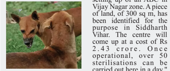
veterinary officer, GMC. Given the increasing population of stray dogs, the council is planning to set up one ABC in each of its five zones.