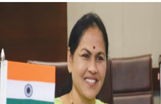
Shobha Karandlaje apologised to people of Tamil Nadu for her remarks linking the Rameshwaram Cafe blast to Tamilians, stating she had no intention to hurt their sentiments.

"I have the highest respect and regard for the history, rich culture, and traditions of Tamil Nadu and its people. I had no intention whatsoever to hurt their sentiments. Hence, I once again tender my apology to the people of Tamil Nadu for any distress caused by my comments," the