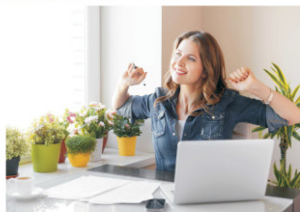
caused by a chair when you tend to sit long hours in the same slouched position. Remember to keep the back

Reduces belly fat, builds endurance Stairwell walk/run: Got no time for the gym? No sweat! Ditch the elevator and take the stairs. This is a great cardio workout and a calorie torcher too! Any aerobic activity lessens bad cholesterol, raises good cholesterol levels and boosts circulation, among things. And as the body uses effort to lift upwards, it helps engage more muscles, even tiny ones, in the leg. Did you know walking up 200 steps twice a day increases aerobic fitness levels by 17%? Try it today. Benefit: Increases circulation, cuts risk of heart attack by 25% Stability ball: Several studies have been suggesting that you swap the office chair with a stability ball. It can repair bad posture because when you try and balance, the body is forced to automatically get into the correct one. This also engages the core and since you have to change your position often it does away with the damage