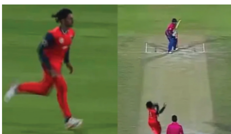
down memory lane remembering Akhtar. Akhtar's international career