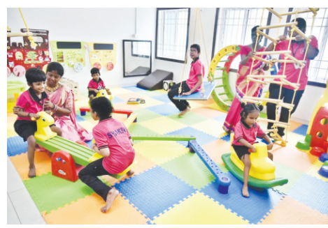
To counter the issue, the integrated education department issued a circular that 95,600

A special school, unaware of the circular, proceeded with the competitions and attempted to upload the results on Education Information Management System. Only then, officials from the school education department informed them about the directive. Excluding talented children not only affects their self-esteem but also denies them an opportunity for creative expression, said special school teachers.