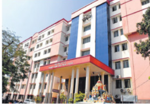
Gandhi Government Hospital, TN Government Multi Super Specialty Hospital in Omandur, Kilpaik Medical

CHENNAI. GCC Mayor R Priya inaugurated a master health check-up camp at Stanley Government Hospital on Tuesday for sanitary workers, including those from NULM and domestic breeding checkers. The corporation has allocated around Rs 1,000 per person for the check-up, with a total budget of Rs 1.19 crore for the first phase which will cover 11,931 employees. The programme, set to cover 4,571 permanent staff and 7,360 temporary workers, will continue over the next three months in Stanley Government Hospital, Rajiv