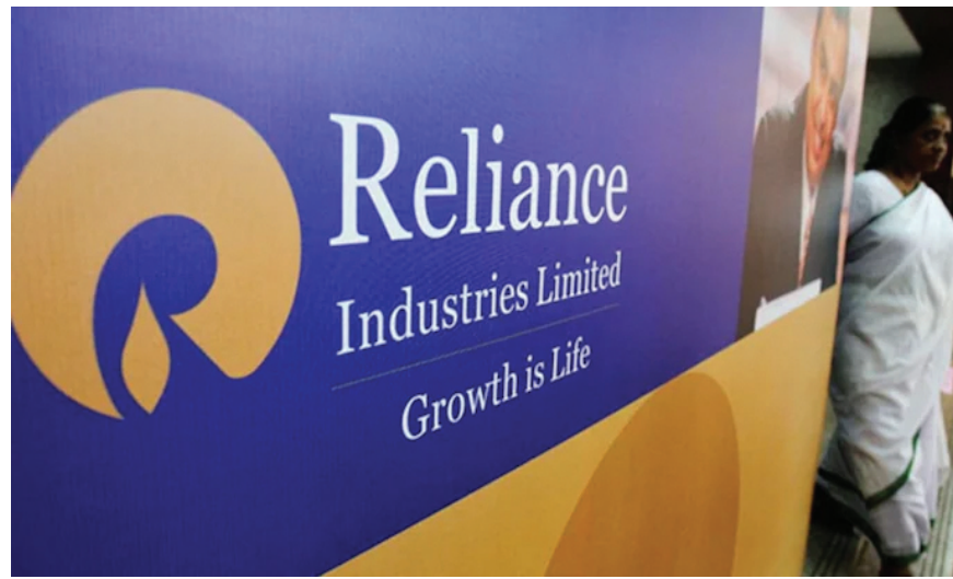
Mukesh Ambani during the AGM.

Stake sale in Oil-to-Chemicals (O2C) business: The market anticipates RIL to outline a strategy for selling stakes in its Oil-to-Chemicals (O2C) division. Details regarding potential bids or buyers for this stake sale are expected to be shared by