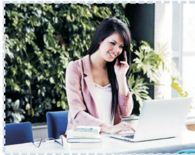
Employers overwhelmingly preferred to hire female candidates who provided information to explain a resume gap, regardless of content.