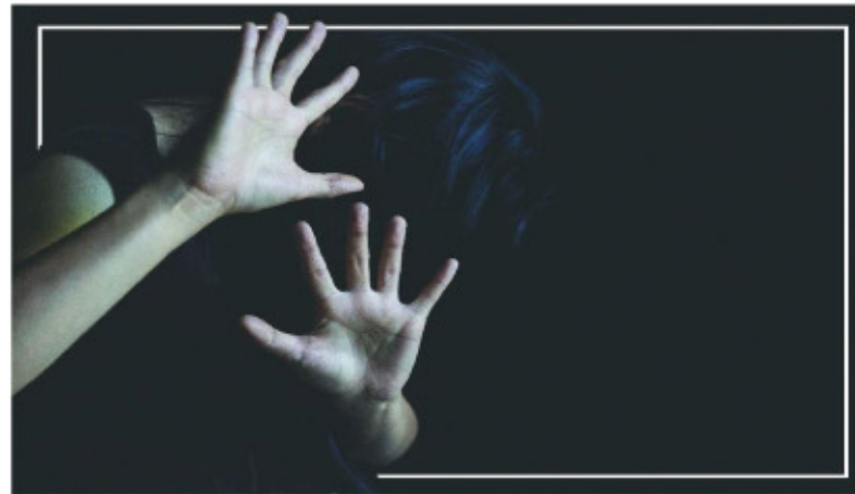
Harassment of Women at Workplace (Prevention, Prohibition and Redressal) Act, 2013, was enacted as an extension of the Vishaka Guidelines with the primary aim of ensuring safe working spaces for women.

THE Kolkata rape-murder has glaringly shown how unsafe and vulnerable working women are. Twenty-seven years after it acknowledged sexual harassment at the workplace as a human rights violation and issued the Vishaka Guidelines, the Supreme Court has directed the Centre and the states to take urgent steps to institutionalise the safety of medics.