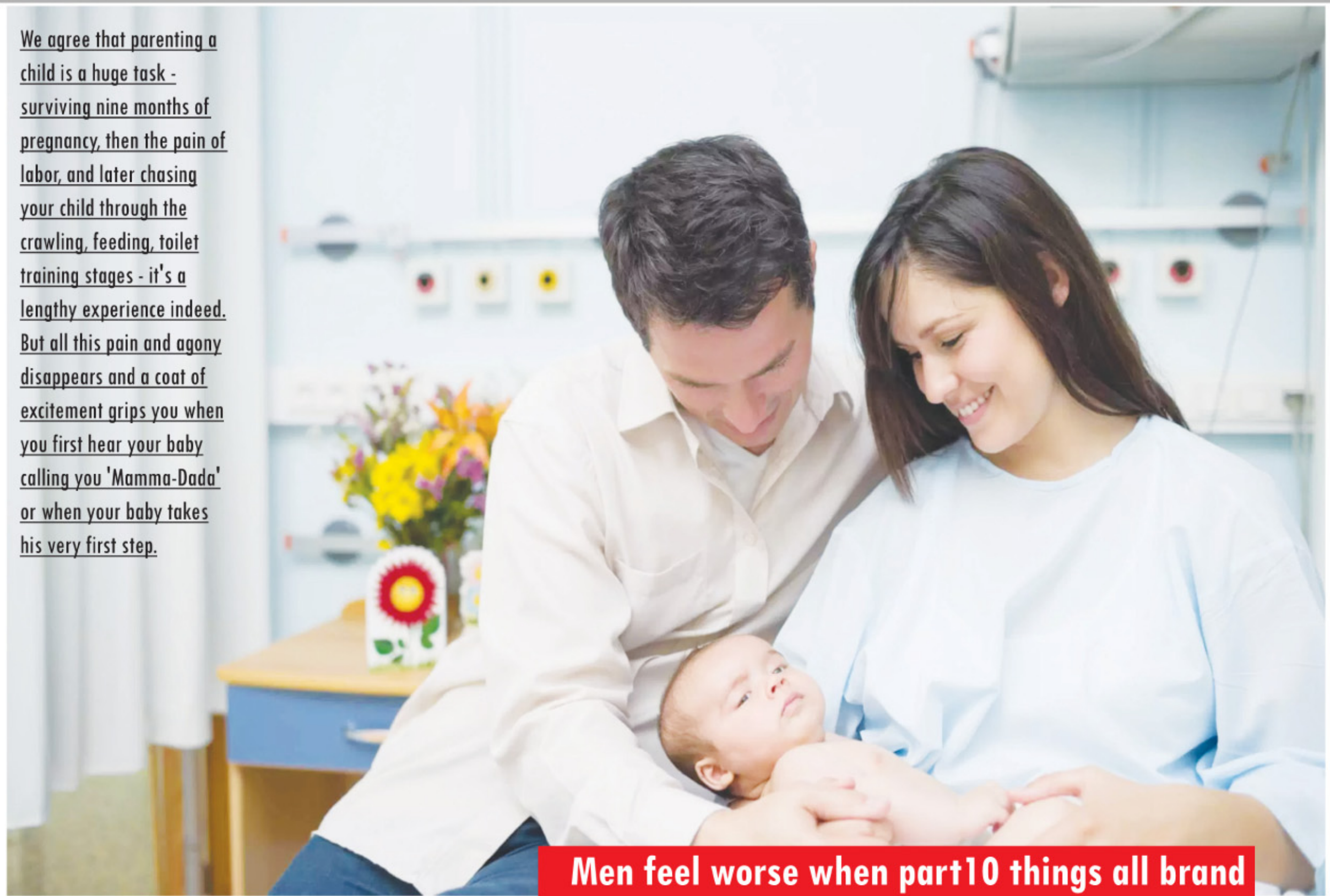
Men feel worse when part10 things all brand

We agree that parenting a child is a huge task - surviving nine months of pregnancy, then the pain of labor, and later chasing your child through the crawling, feeding, toilet training stages - it's a lengthy experience indeed. But all this pain and agony disappears and a coat of excitement grips you when you first hear your baby calling you 'Mamma-Dada' or when your baby takes his very first step.